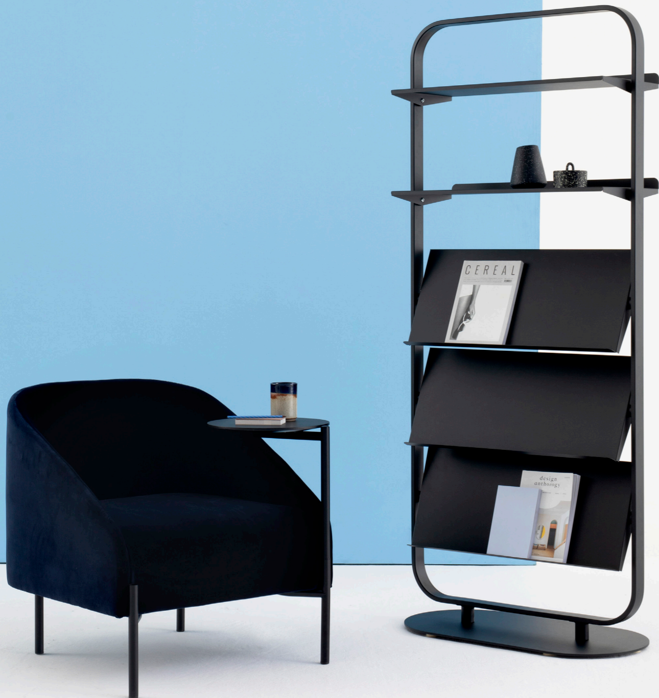
DESIGN GERALD BRANDSTATTER