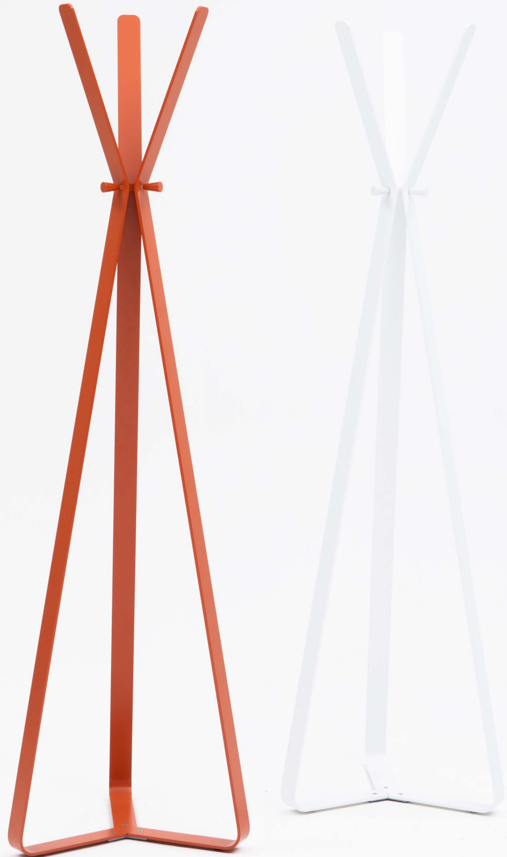
DESIGN PETER VAN DE WATER