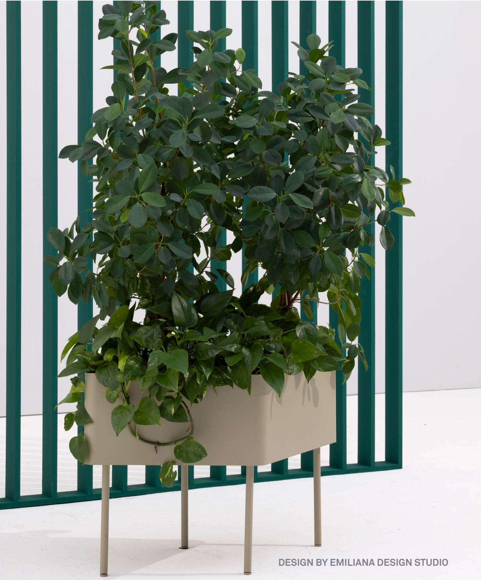
DESIGN BY EMILIANA DESIGN STUDIO